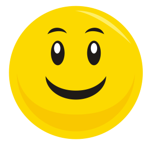
Very good! I listened and sat still.