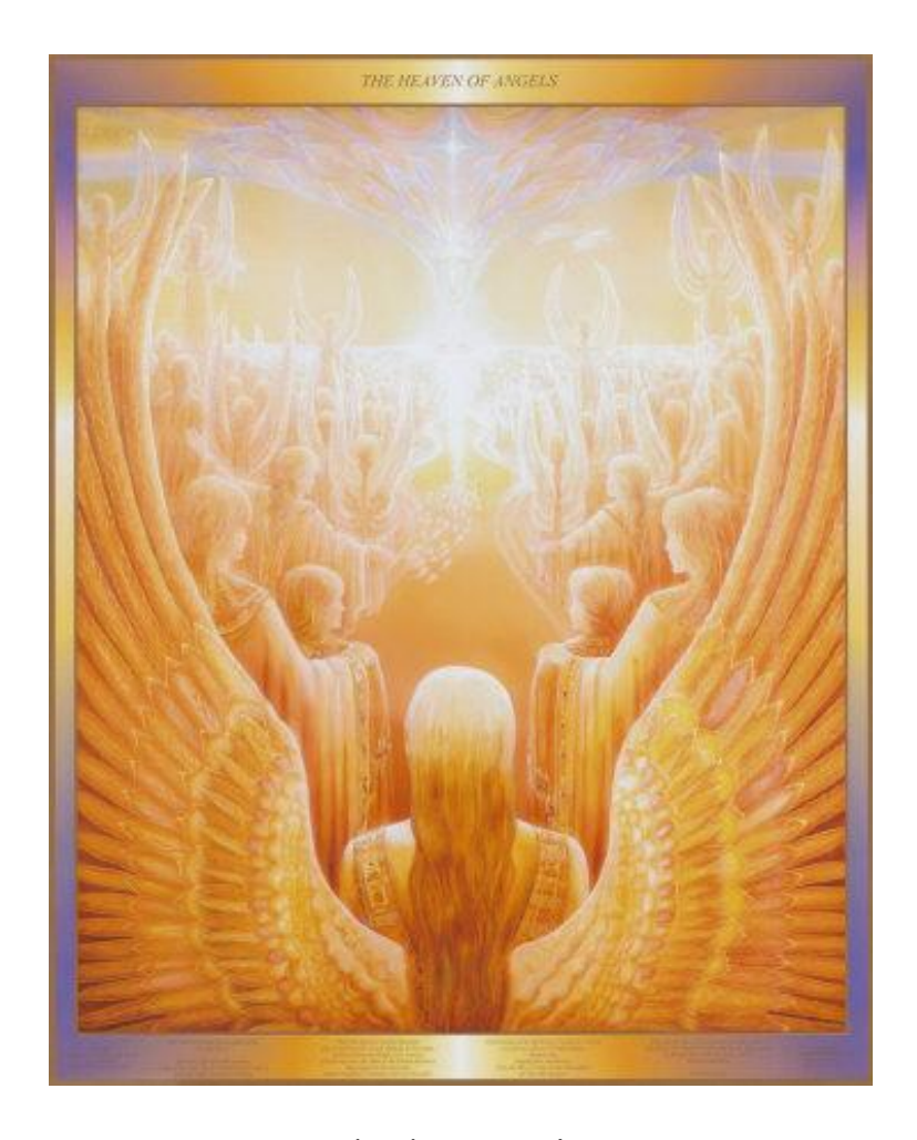
We join with the angels in singing: GLORY TO GOD IN THE HIGHEST!