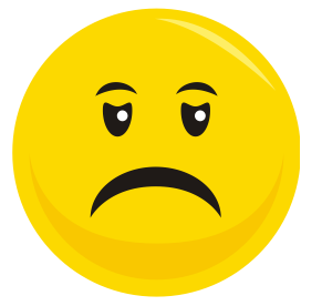
I tried to be good, but I forgot a few times. I'll keep trying!